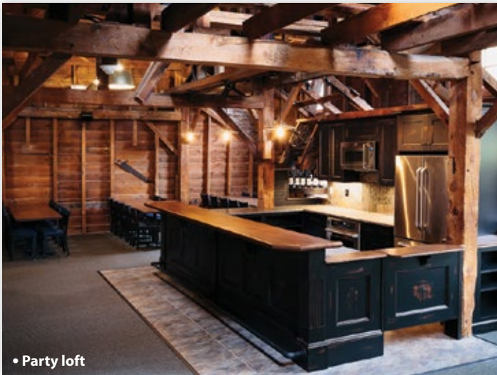
• Party loft