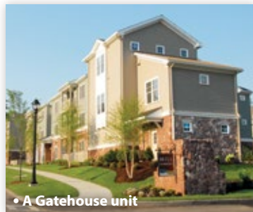
• A Gatehouse unit